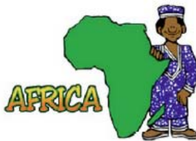
MOROCCO & EGYPT